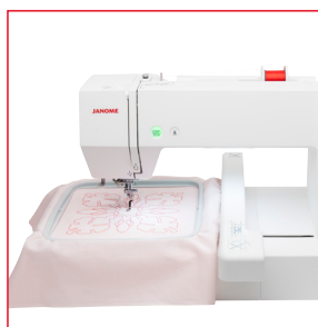
Embroidery up to: 7.9" x 7.9"