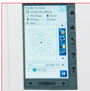
Full Color LCD Touchscreen